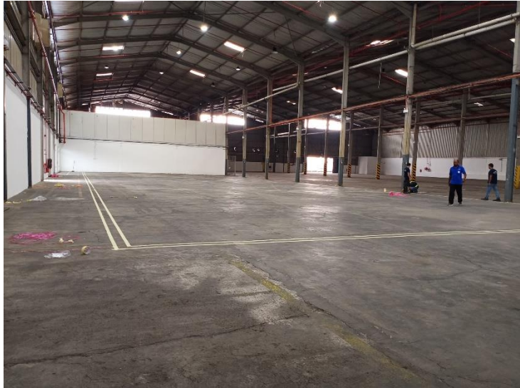
Internal photos of warehouse