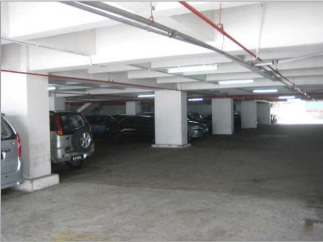
Lower Ground Car Parks