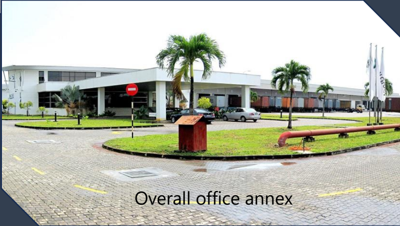
Overall office annex