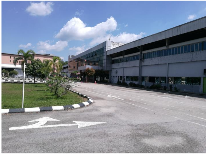
Block 1 Overall View