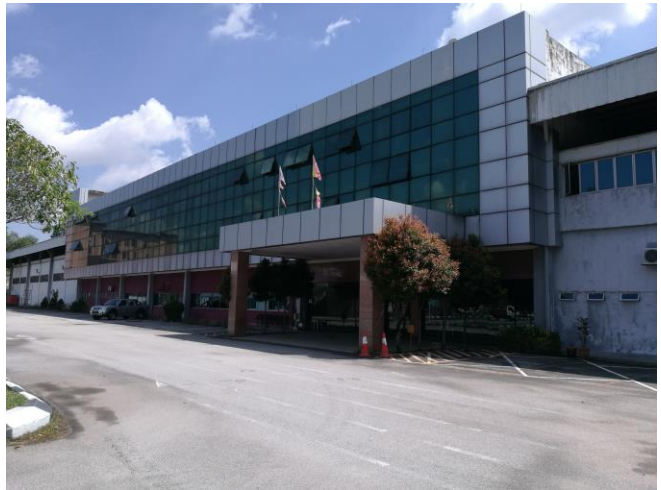
3 Storey Office Annex