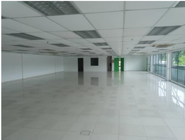
4 Storey Office Annex