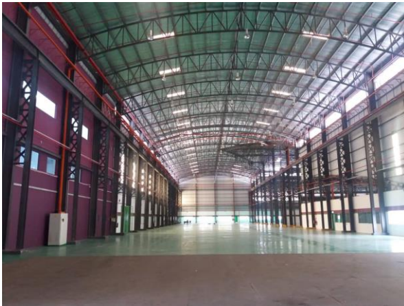
Single Storey Factory