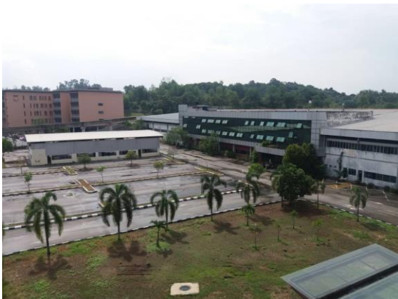
Top view from 4 storey office annex