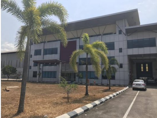
Front View Single Storey Factory with 4 Storey Office Annex