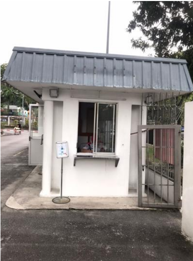
Entrance Guard Post