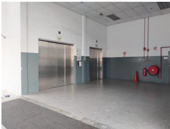
Loading Bay and Cargo lift